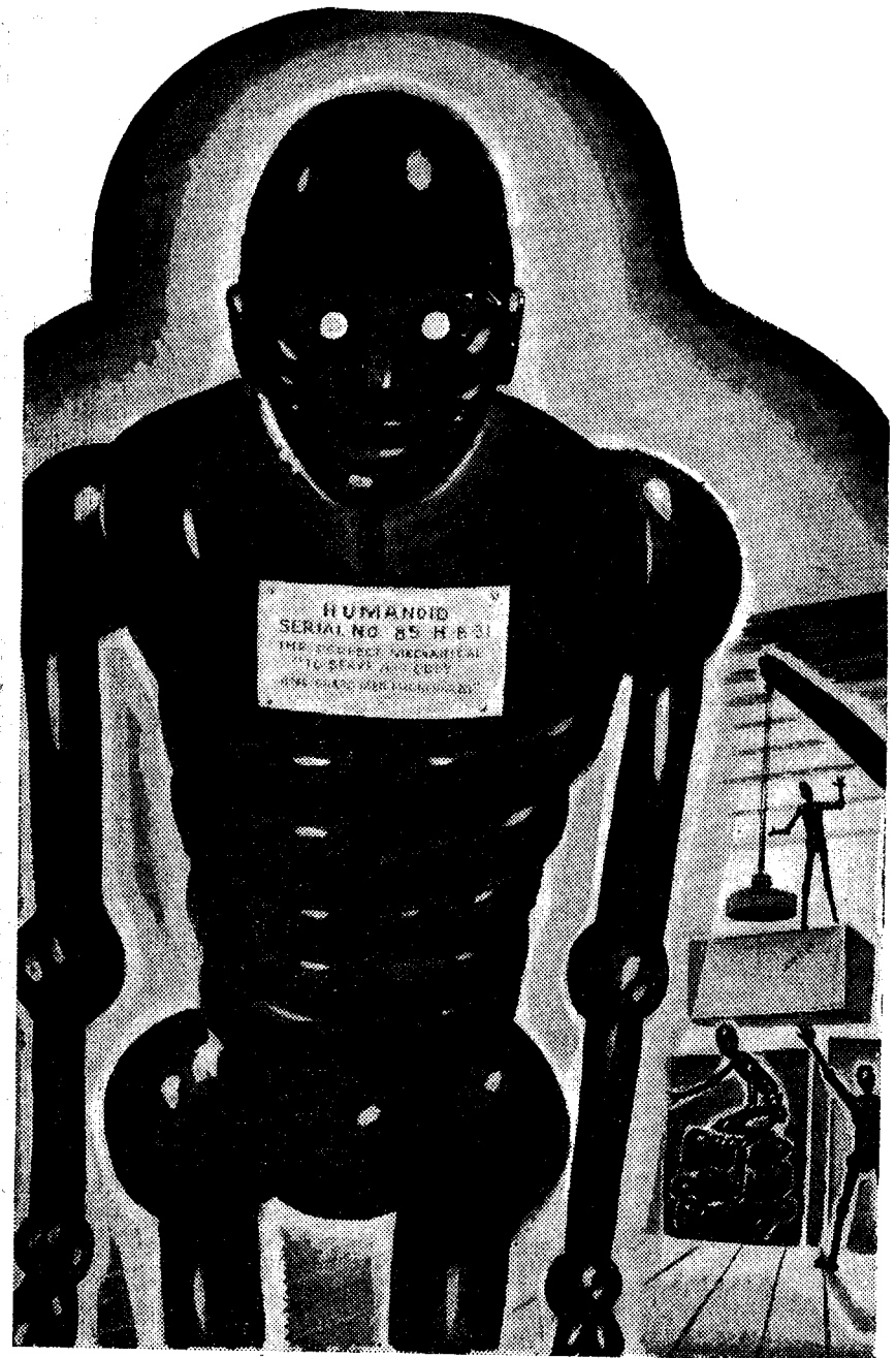
WITH FOLDED HANDS . . .

"Your wife has been kind to me, Mr. Underhill, when I was in des-